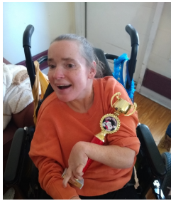
And the winner is...