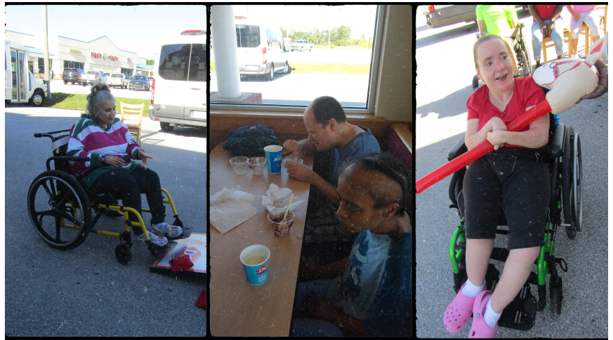
This month, we partnered Dairy Queen in Swansboro to host a sip and paint for our members and a Carobell night for the community, where a portion of proceeds was donated to Carobell. We're grateful to the businesses and organizations that support us so we can provide the best for our members!